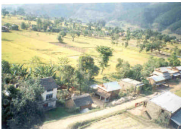
Gadkhar FMIS Command Area

The Gadkhar Irrigation System (GIS) is located in the Chaughada Village Development Committee of Nuwakot District of the Central Development Region of Nepal. It is linked with 12-km long fair weather road to Gangate/Battar, a point on the Kathmandu – Trisuli highway.