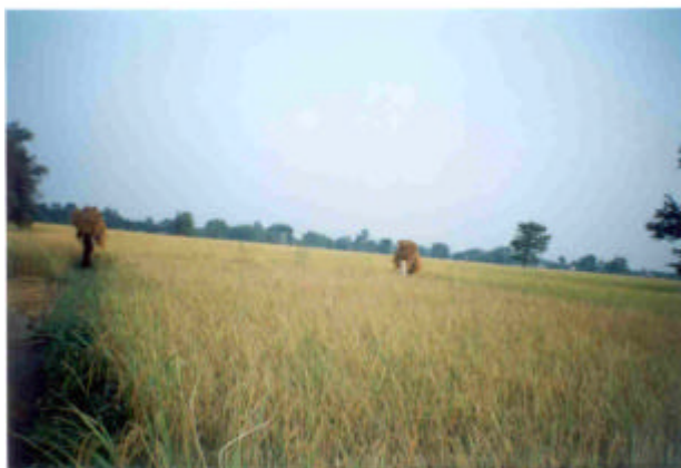
Paddy Field in Gadkhar FMIS

Major rehabilitation and extension of command area was done in 1994 with the financial and technical assistance of Department of Irrigation.