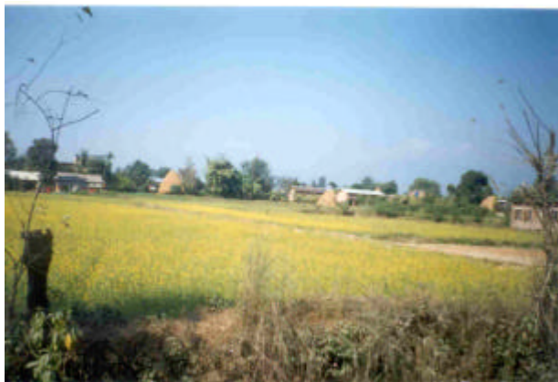
Laugain FMIS - Command Area

Committee in Kapilvastu district in Terai of the Western Development Region. It is at a distance of 35 km west from Butwal. Most of the settlers